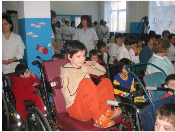
The children are enjoying the party.

17.12. – Dren Home- 42 children, age 3-7, 18 of them with disabilities. We have 9 grannies (babas), taking care of the handicapped children. We provided puppet show for the kids and animators to take care of the fun. We brought them lots of big toys – child and doll's houses, kitchen and laundry centers and many toys, for which the children had written to St. Clause.