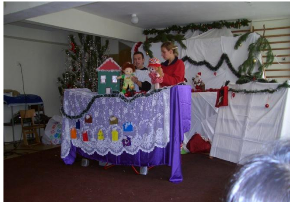
The puppet show's performers.