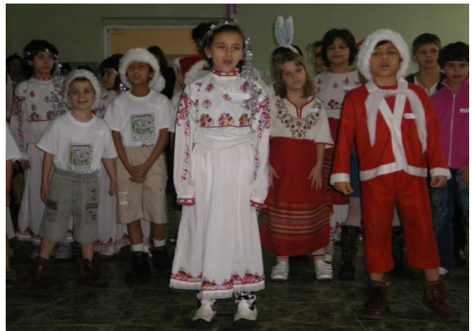
A girl from the orphanage is singing a Christmas carol.