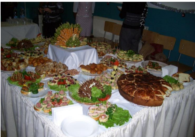
We are proud with the cooking skills of children.

18.12. Razliv Home – 42 children, age 7-19 (few are slightly retarded). The Mayor of Pravets (regional town, near Razliv) attended the party. The children performed a play about Jesus' birth, sang carols and danced. The children who participated in the cooking lessons and their teacher had cooked delicious food for the party. We gave the children two pairs of shoes: sports trainers and winter boots, sweets, fruits, bed linen and toys.