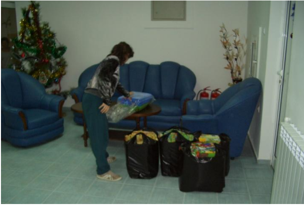
We donated them bed linen and fruits.