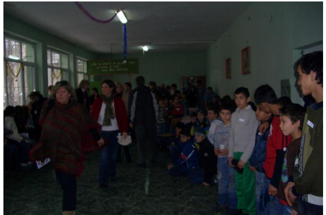
The group is enjoying the party.