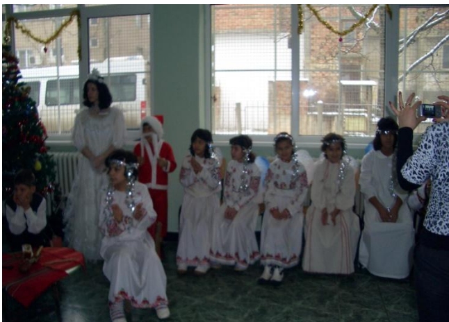
The kids from the orphanage are performing!