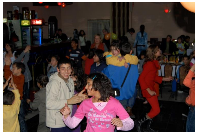
The kids are enjoying the tasty food and drinks.