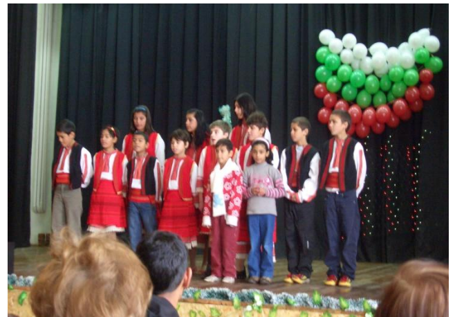
The children are performing with enthusiasm.

MANY THANKS TO ALL PEOPLE WHO HELPED THE LESS FORTUNATE CHILDREN HAVE GREAT CHRISTMAS!