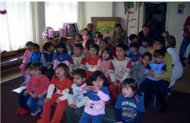
The children are watching the puppet show with interest.

17.12. – Dren Home- 42 children, age 3-7, 18 of them with disabilities. We have 9 grannies (babas), taking care of the handicapped children. We provided puppet show for the kids and animators to take care of the fun. We brought them lots of big toys – child and doll's houses, kitchen and laundry centers and many toys, for which the children had written to St. Clause.