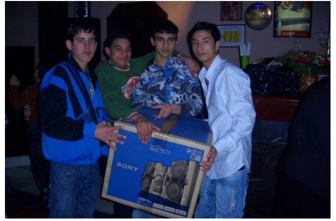
The elder children are happy with the new stereo.

16.12. – Vratza Home –Asen Zlatarov (70 children, age 7-20, 30 with disabilities). About 50 children from AAS participated in the event. They had prepared presents in shoeboxes for all the kids from the Home and delicious refreshments and drinks. They were all happy, sang and danced together. The children from the Home performed a play about Jesus' birth. We donated then fruits, bed linen and money for their Charismas discotheque which trilled them.