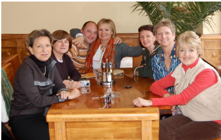
What a great company we have on the trip to Pleven!