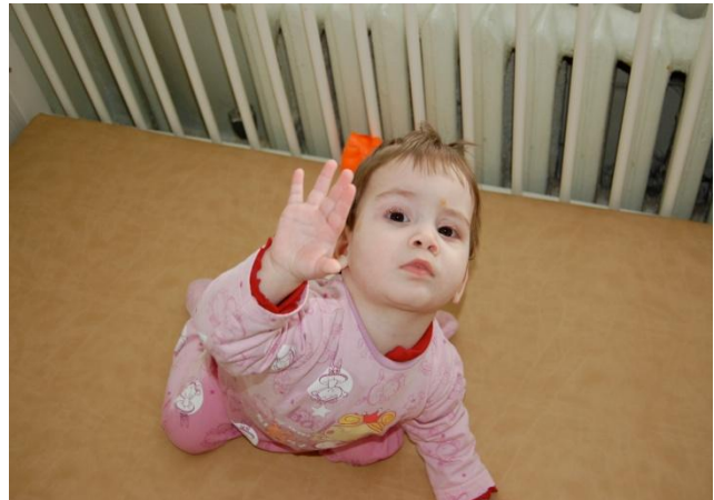
A Pleven girl is bidding us welcome!