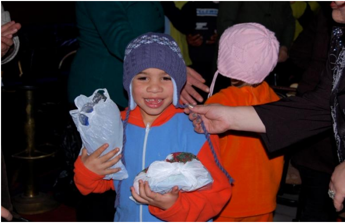
Isn't it great to have a warm hat and gloves for the cold winter!